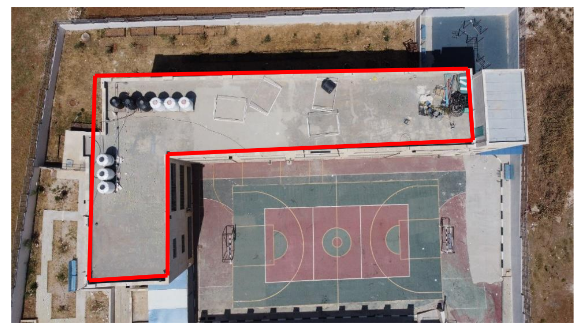
§308 Sheikh Saad Girls' School (31.7395, 35.2567)