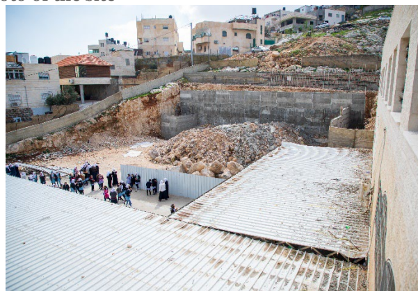
Picture showing external playground/retaining walls