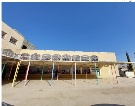
Picture showing external existing old canopy