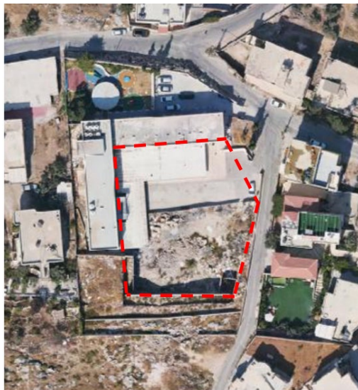
Aerial photo of the site

§280 Below pictures showing aerial photograph for the project as well as existing site condition at the location of intervention.